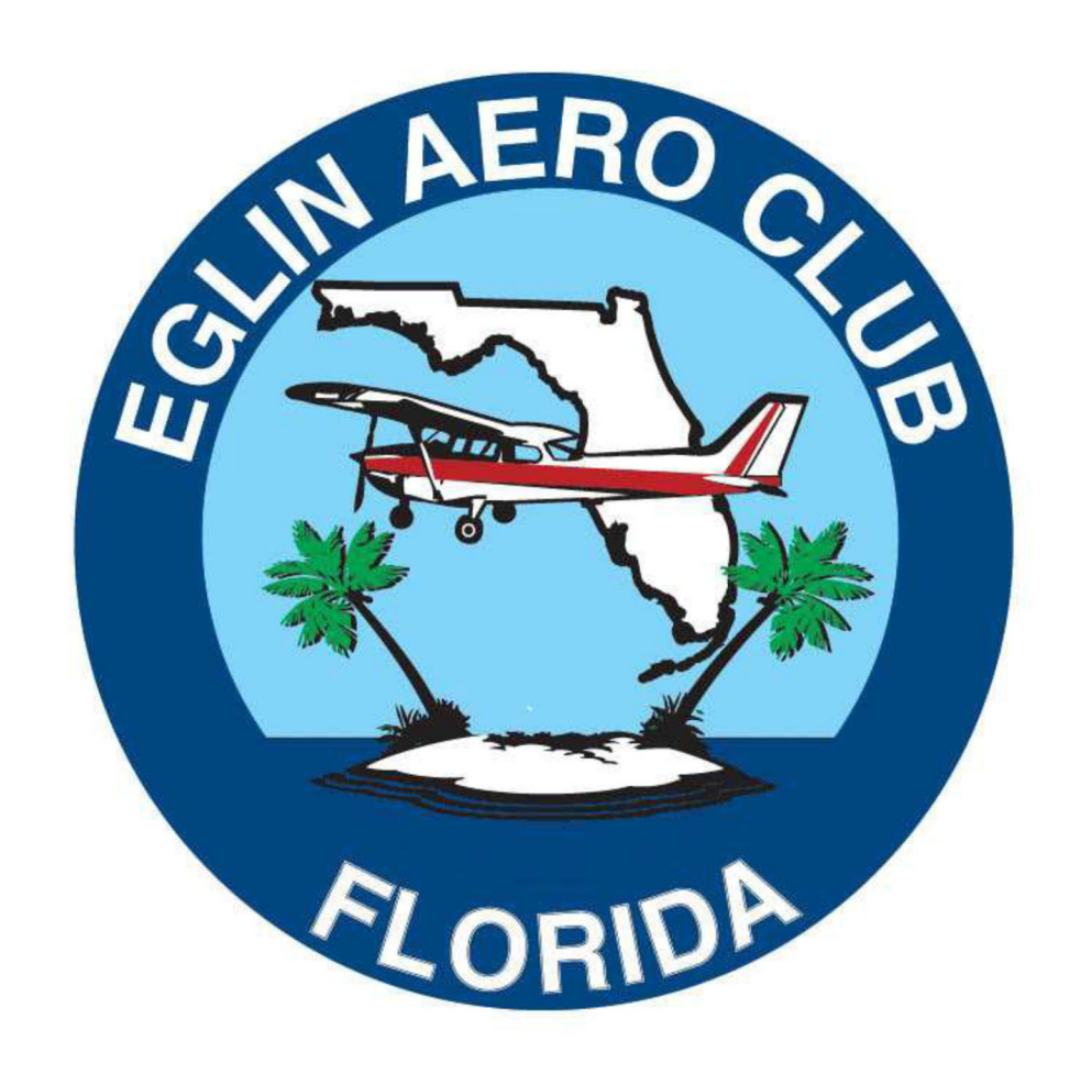
STANDARD OPERATING PROCEDURES APRIL 2023